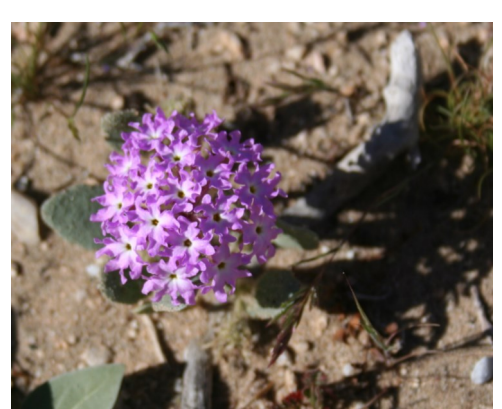
5. Sand Verbena