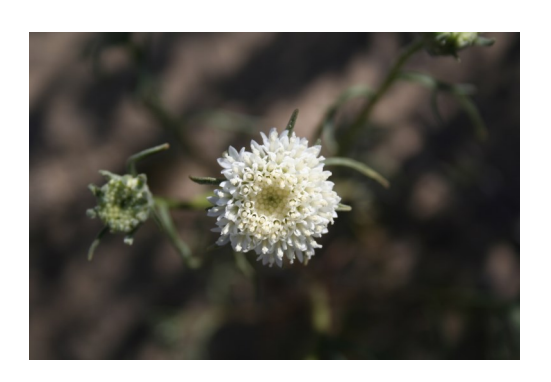
15. Fremont Pincushion. East side of park has large displays of a different pincushion that is shorter and grows more closely together.