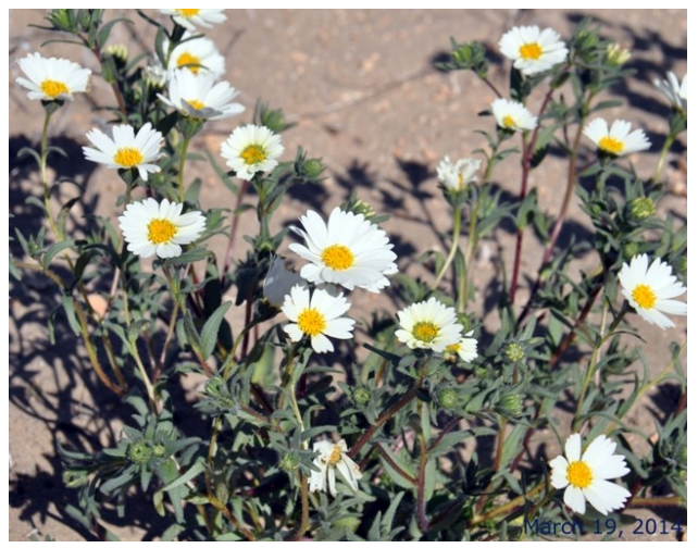
18. Desert Tidy Tip

The very fragrant coreopsis grows in large fields throughout the eastern Antelope Valley. Another variety of coreopsis growing east of the Indian Museum is Leafy Stem Coreopsis.