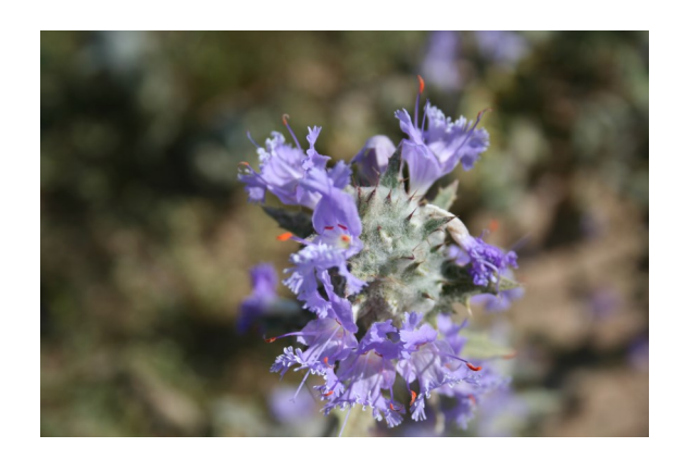
Thistle Sage South side of Avenue K east of 20th Street East