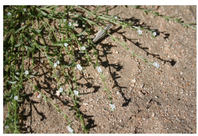
14. Another Forget-Me-Not!