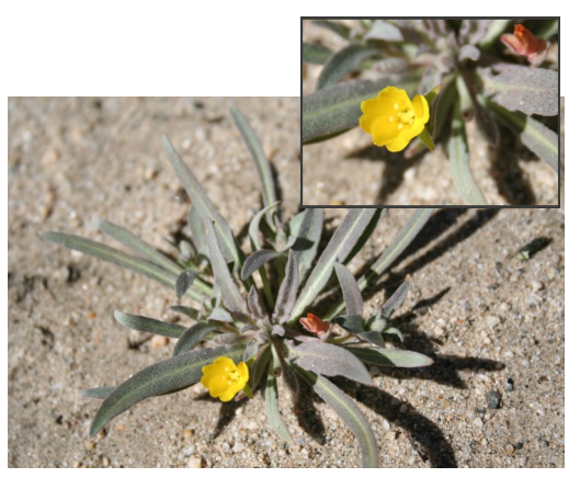
6. Desert Suncup