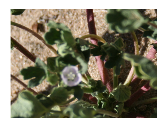
11. Trailing mallow - flowers which are very small can be pink or white