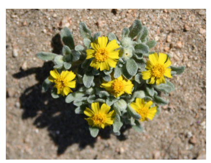
4. Wallace Eriophyllum