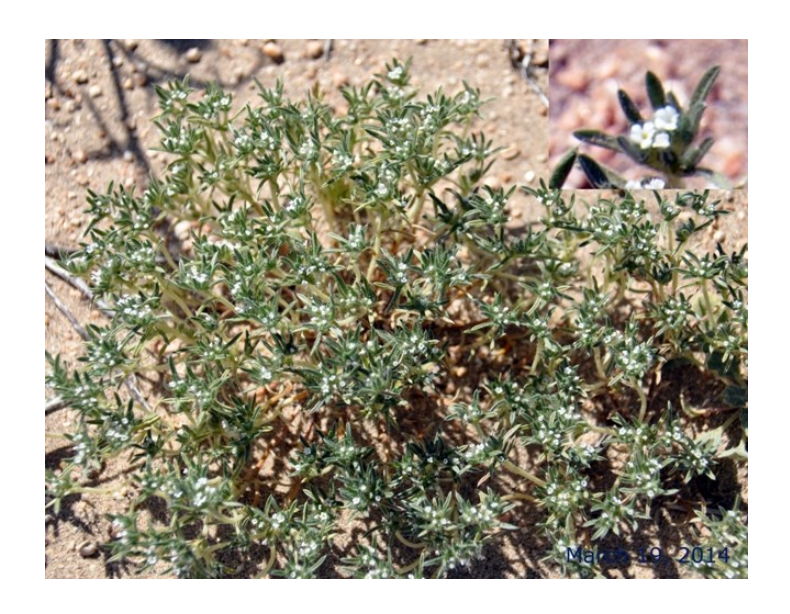
13. One of the many kinds of Forget-Me-Nots.