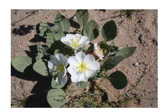
7. Dune or Birdcage Primrose