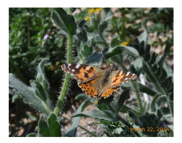
24. The inevitable Fiddleneck. Not a favorite with many flower watchers but much loved by Painted Lady butterflies!