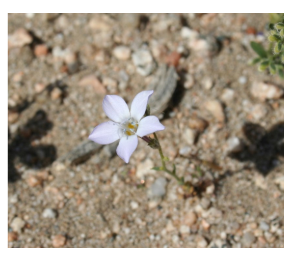
23. Tiny Gilia - single flower on single stem, picnic area