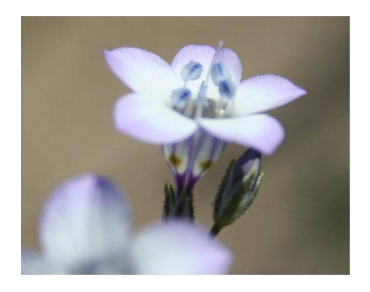
Gilia growing at Saddleback in March and April of 2014 has yellow dots in throat - really quite beautiful!