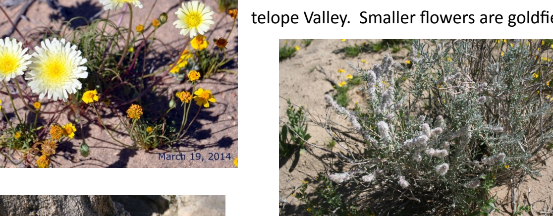
20. Winter Fat (shrub)

19. Desert Dandelion. Although missing in these flowers, many have a maroon center. These can cover large areas on the central and eastern Antelope Valley. Smaller flowers are goldfields