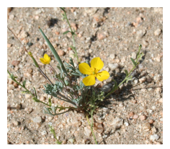
22. Little Gold Poppy, found in picnic area