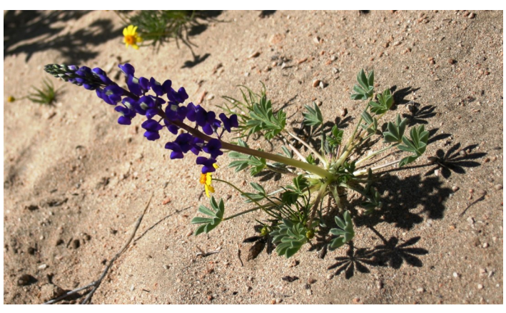
9. Royal Desert Lupine