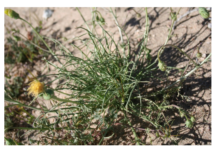
12. Mystery! None of us can figure this one out. If you have a suggestion email: