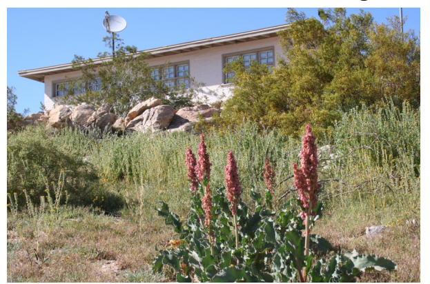
16. Wild Rhubarb